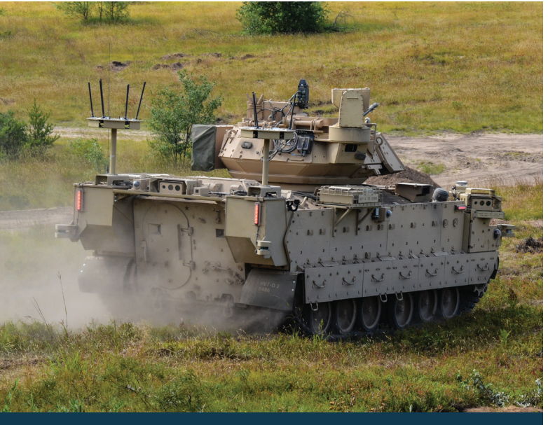
The Mission Enabling Technologies Demonstrator manned vehicle can control two unmanned platforms.

When asked how the Army plans to address the challenge of development and deployment of so many next-generation technologies at the same time, GVSC/CFT team responded: "The technologies themselves are just tools. The success in their deployment will be the result of input from soldiers, how we can effectively provide proven capabilities in the real-world environment in which they'll use them.